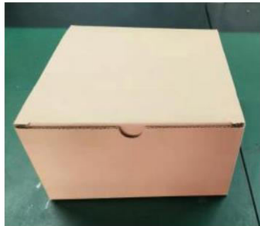
18.7*18.7*10cm, Only for 1unit;